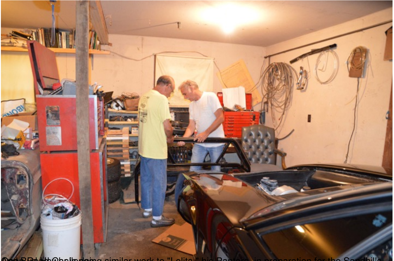
Open Road Challenge doing similar work to "Lolita," his Pantera, in preparation for the Sandhills

Tuesday, 02 August 2016 19:35 - Last Updated Wednesday, 03 August 2016 18:10